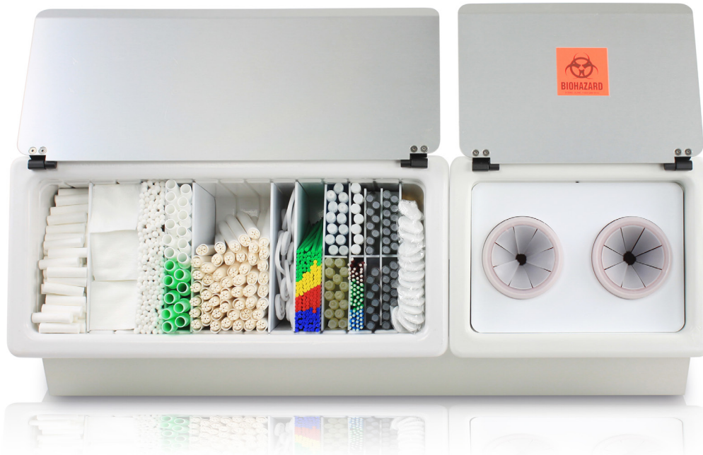
Configured EP Consumables Bin & Med-waste with aluminum wall/shelf bracket.