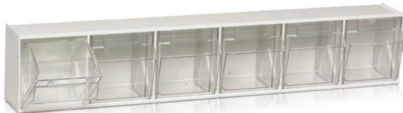
6 Bin Unit (item M1F2)