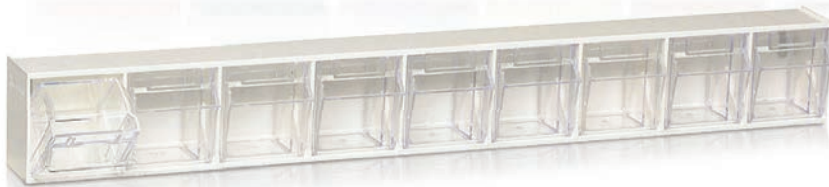
9 Bin Unit (item M1F1)