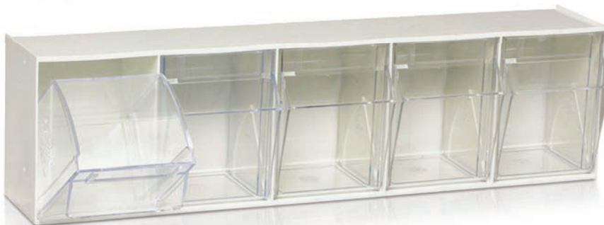
5 Bin Unit (item M1F3)